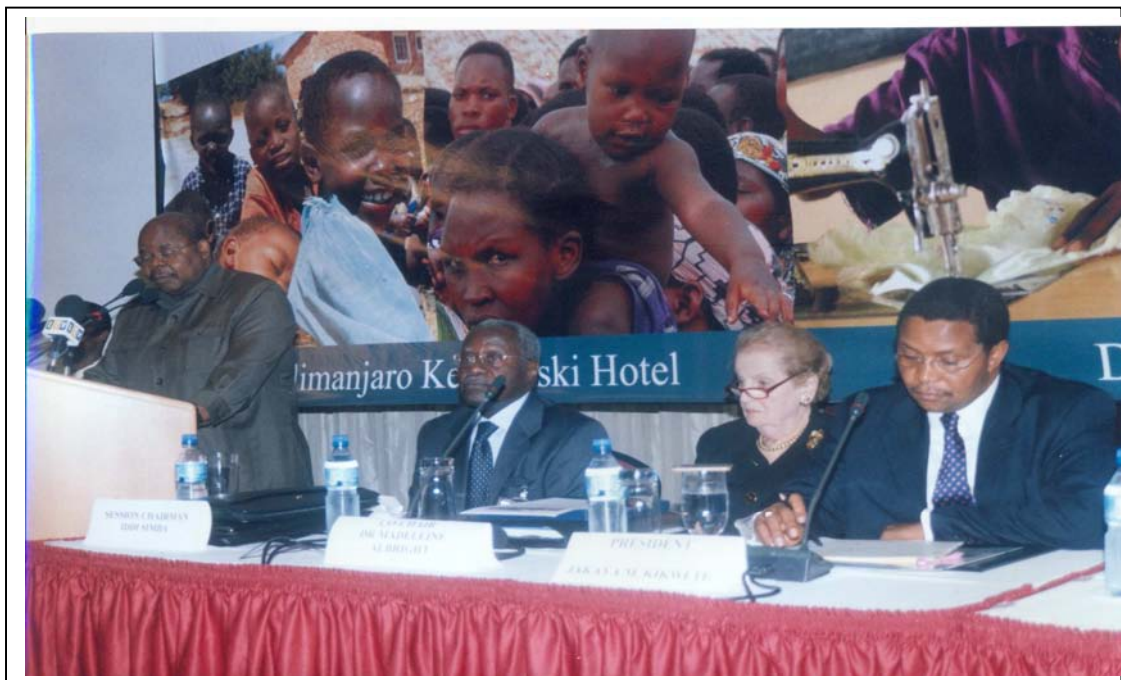
President Jakaya M. Kikwete with the Co-Chair of CLEP Hon. Madeleine Albright and the Former President Hon. Benjamin W. Mkapa during the official opening of the