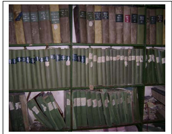
Systems that existed in the 1920s