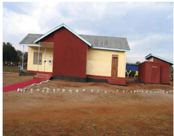
New Mzeri Village Government and Land Registry Office