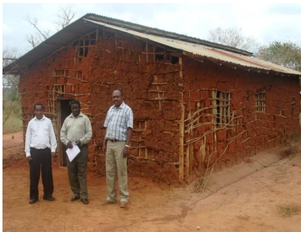
Old Mzeri Village Government

Through the implementation of Land titling projects in Handeni, Bagamoyo, Hanna Nasif – Kinondoni evidence has been collected to certify that owners of hitherto extra legal assets attach substantial value to Legal ownership of their properties and foresee enhanced economic potential in using formalized assets. Indeed some owners of recently formalized farm lands in Handeni District are in the processes of using the certificates for Customary Right of Occupancy (CCRO). Communities enthusiastically participated in improving Land Registry buildings – a measure of their acceptance of the Program.